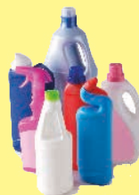
Cleaning product packaging