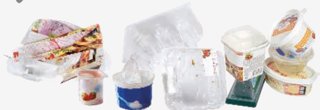
'Lightweight' plastic boxes, pots & containers