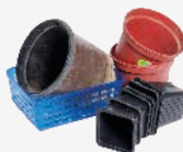
Plastic containers & plant-pots