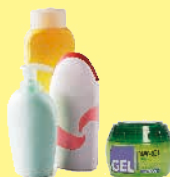
Beauty and hygiene product packaging