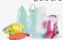
Plastic sachets, bags and clingfilm